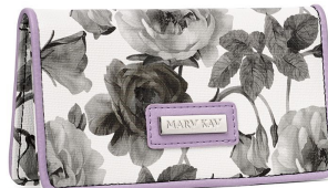
checkbook Holder + $ bag