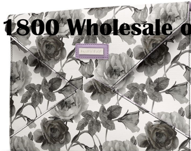
Envelope Folio Bag +chbk hldr +$ bag